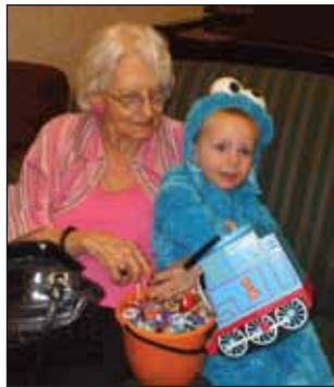
Children bring such joy and happiness with the littlest of things.